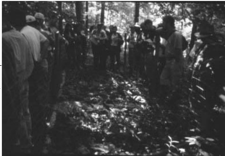
Participants at the agroforestry conference at Cornell inspect ginseng demonstration plots at the Arnot Forest. This bed includes wild-collected plants from the Catskill Mts. and seedlings from Michigan.

Several private organizations are cooperating with Cornell in these demonstration trials, including the New York State Ginseng Association and a newly formed growers' group, the North American Ginseng Association. □